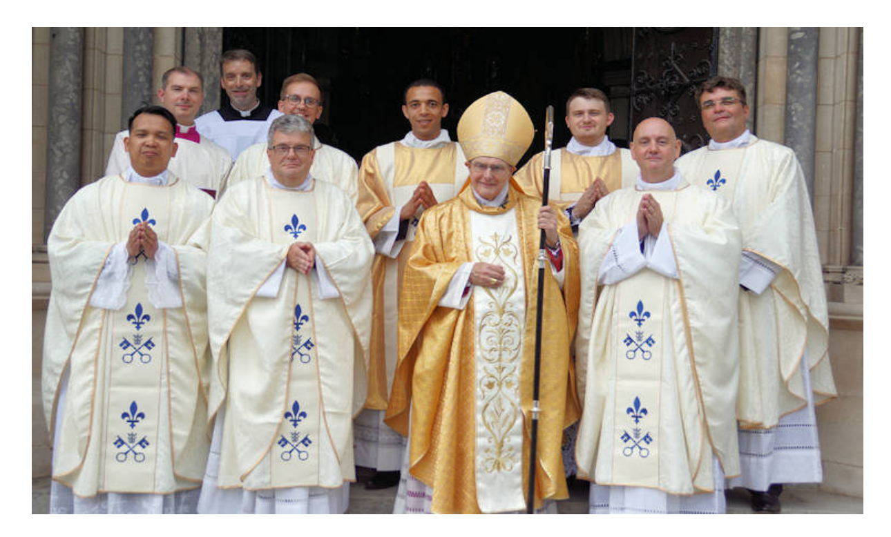
The above picture shows the five priests ordained at St John's Cathedral, Norwich on 6 July 2019.